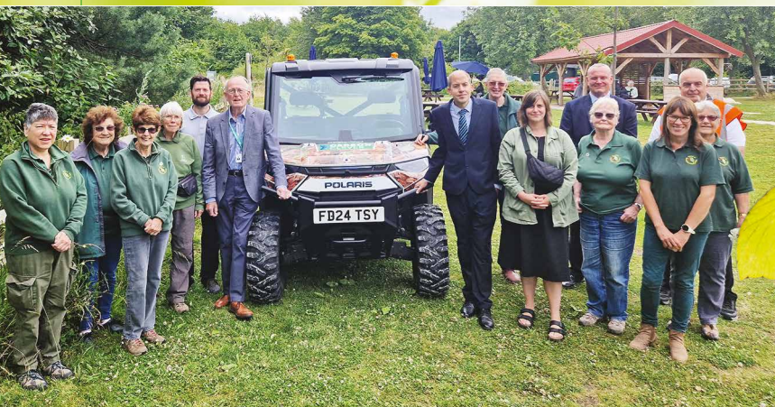
Pictured above: Friends of Rushcliffe Country Park and local Councillors invite you to join the Wildlife Day this August.

Over the years the wildlife has found its own way back, ready for us to discover. Come and help explore it even further! Simply meet at the play area on the day or email countrypark@rushcliffe.gov.uk for more information.