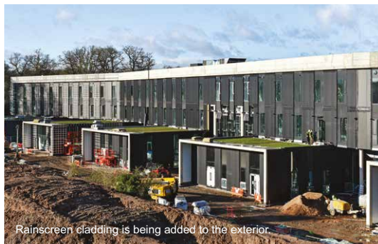
Rainscreen cladding is being added to the exterior.