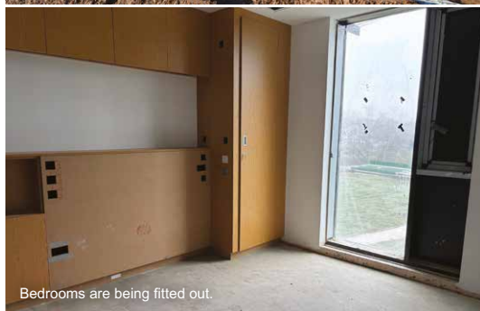
Bedrooms are being fitted out.