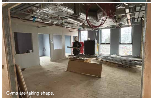
Gyms are taking shape.