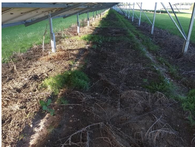
Figure 6: Channels created by panel runoff within 12 months of site operation commencing

Land between and underneath the PV panels is often grazed by sheep and where there are high numbers of sheep a solid compaction layer 2 cm to 6 cm over a wide area may result (Defra, 2021). There is likely to be some instances of run-off from the solar panels, which could result in the compaction of soils at the base of the panels (Choi et al,2020). Over time rivulets can form along the trailing edge of the panel with potential risk of soil erosion creating rills and gullies across the site. The sand bed could act as a drain, especially on heavy textured soils, leading to drainage discharges or wet patches at the down slope end of each trench.