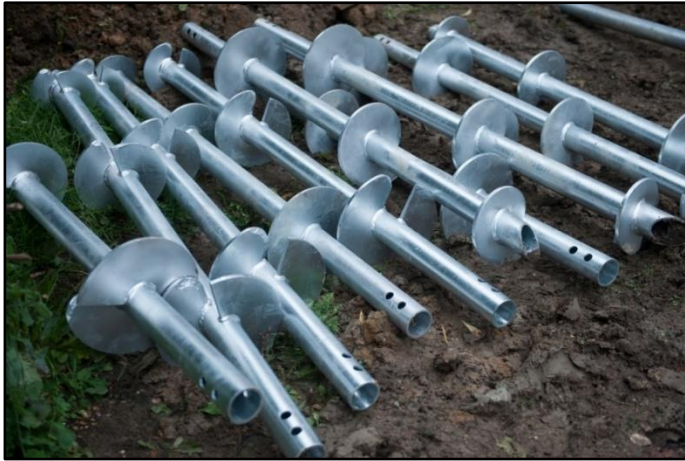
Figure 2: Helical beams