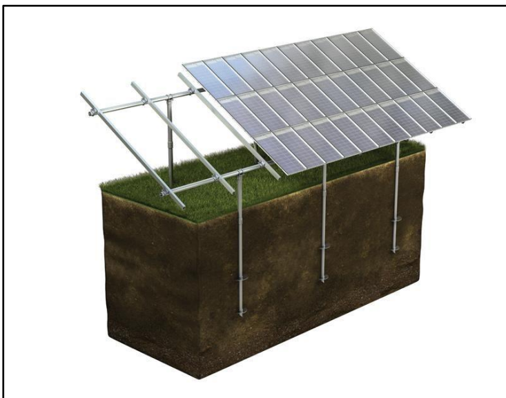
Figure 3 Helical piles at depth (Goliathtechpro.com)

H beams are used on larger scale developments as they have a stronger load bearing and require fewer penetrations per rack compared to helical anchors or ground screws.